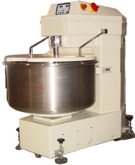
Model FBM-120 shown