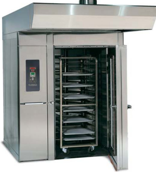
Model LRO-2 Shown (Rack not included)